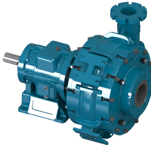
A typical picture of the pump is shown. Please contact Cornell Pump Company for further details. All information is approximate and for general guidance only.